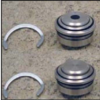
Pictured above: The famous VX-I & VX Stainless Steel, NEMA 4/4X & 12 Vandal Proof pushbuttons