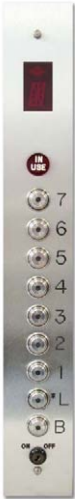
Pictured above: Skinny Material Lift Hall Station with position indicator. Button centers at 1.75" giving you the maxim number of components while minimizing faceplate size.

Skinny car stations, custom enclosure and faceplate sizes, you name it we can do it. Our VX MPB contact block has some great features including it's compact size and voltage rating 6-240 AC.