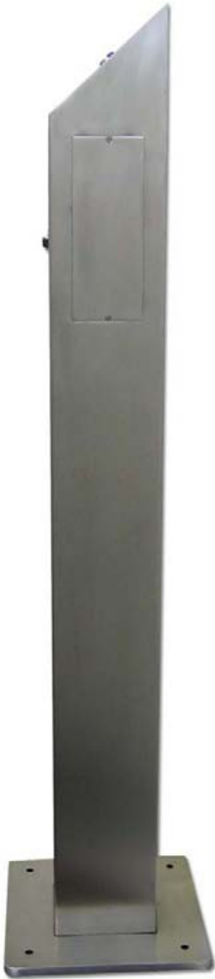
Pictured Right: MPB Contact Block with Lamp and Pushbutton Actuator. 1/2" Thick Stainless Steel plate and hollow tube slanted pedestal station. Meets ADA and Fire Service Requirements and is NEMA 4X.