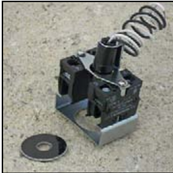
Pictured above: MPB Contact Block with Lamp and Pushbutton Actuator, very compact, space saving, multi-voltage design. allows a 1.75" button center distance!