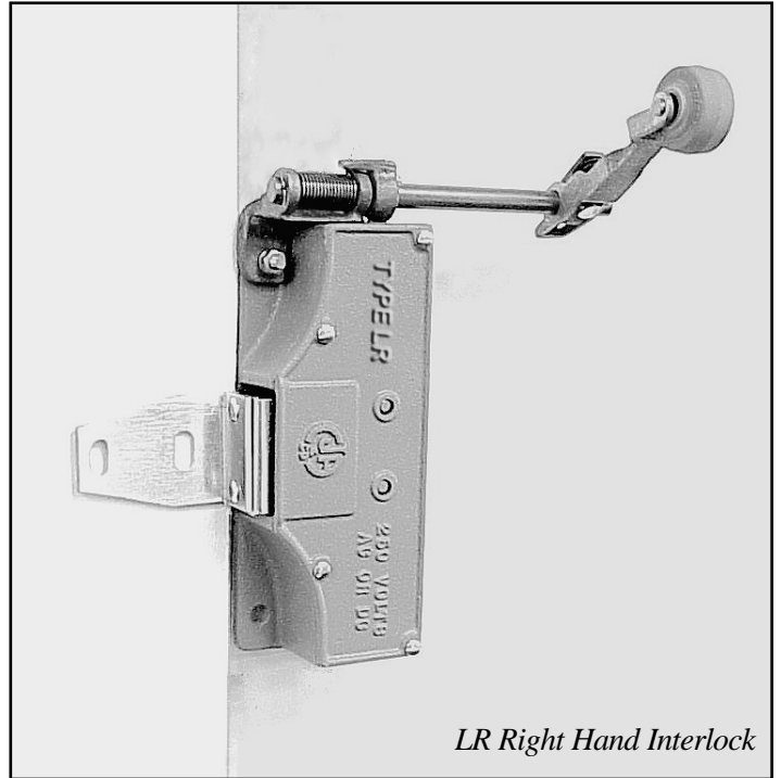
LR Right Hand Interlock

In the event of an emergency either break the glass, or open the cover with a key, pull the chain and the roller arm releases.