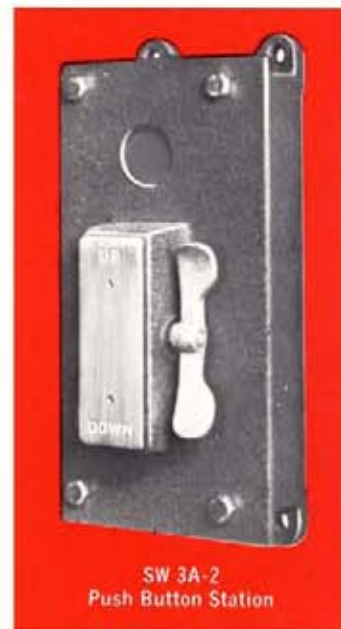
SW 3A-2 Push Button Station

That's why, if the environment's certain to be wet, C. J. Anderson's waterproof is your safest bet. The proof's in waterproof.