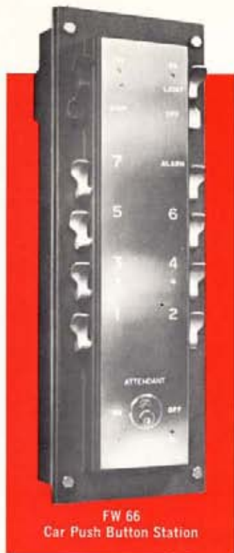
FW 66 Car Push Button Station