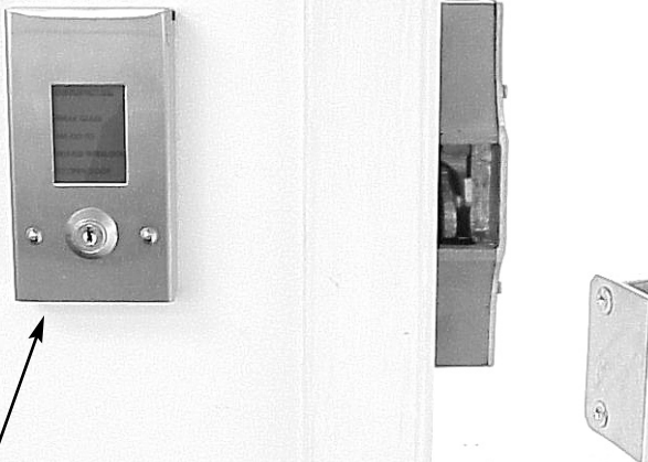
ITEM: 77784-C KEB - Lockable Emergency Box with Glass Cover Used with HG-1, HG-2, CV-1, CV-2, SR, HR-1, LR, L-1, RSB & SDC Interlocks

In the event of an emergency simply break glass cover, or use key to unlock cover, pull the chain inside the box and the roller arm will release the latch allowing the door to open.